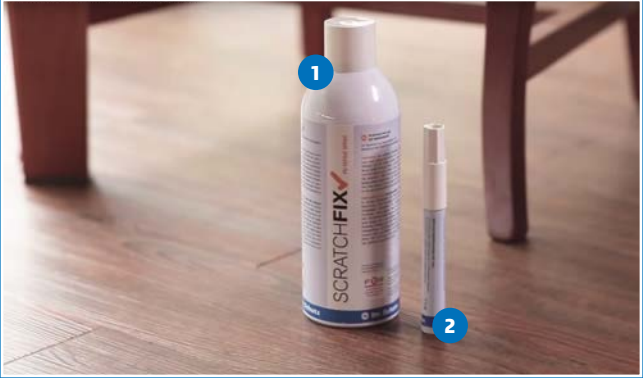
Scratchfix Floor Repair Set ITEM-NO. 0601000450